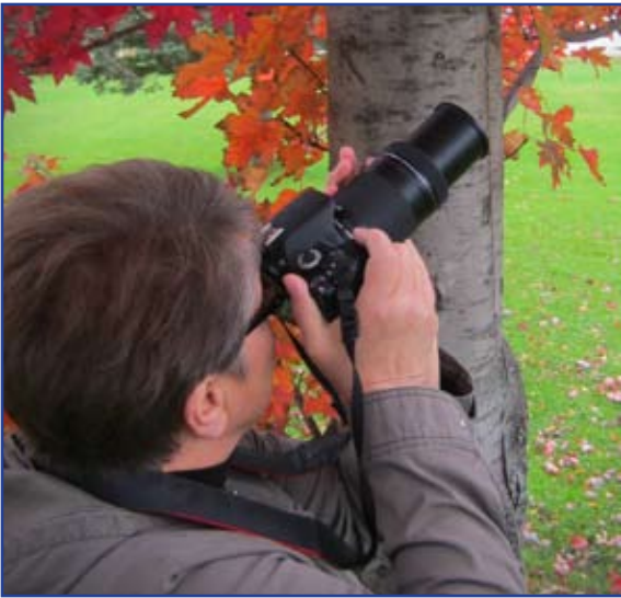
Photographer Vicki Lantto of French Lake, Minnesota, will be contributing a 10 cm x 12 cm art work to the Imago Mundi art project.

The Sami Cultural Center will host an exhibit of the collected pieces from around the U.S. and Canada at the annual Holiday Open House on December 6th before the work is shipped to Italy. We are so honored to be included in this amazing collection of wonderful art.