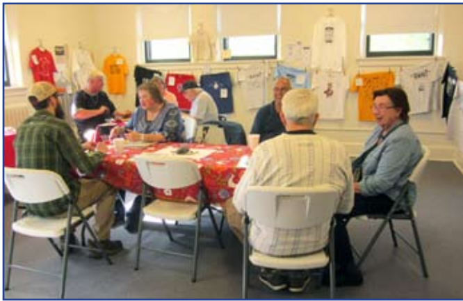
Folks enjoying visiting at the opening of the T-Shirts on Line exhibit on June 7, 2016.

Check out the Sami Cultural Center's T-Shirt shop at Big Frog T-Shirts, 5115 Burning Tree Rd, Suite 315b, Duluth, MN (near Best Buy) or order from this link https://www.shopbigfrogduluth.com/collections/sami-cultural-center