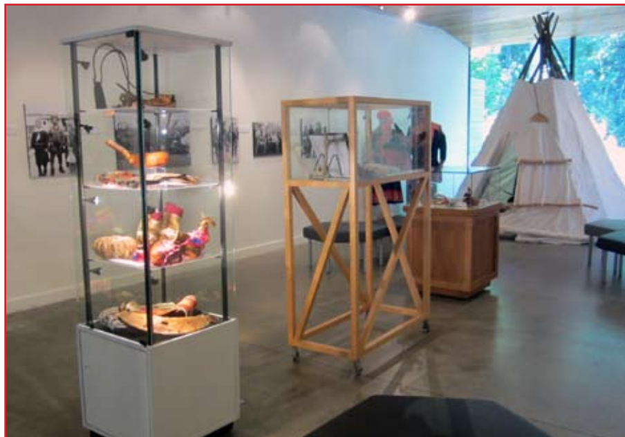
An overview of exhibit installations including the lavvu furnished by Dianna Ng and transported from Seattle.