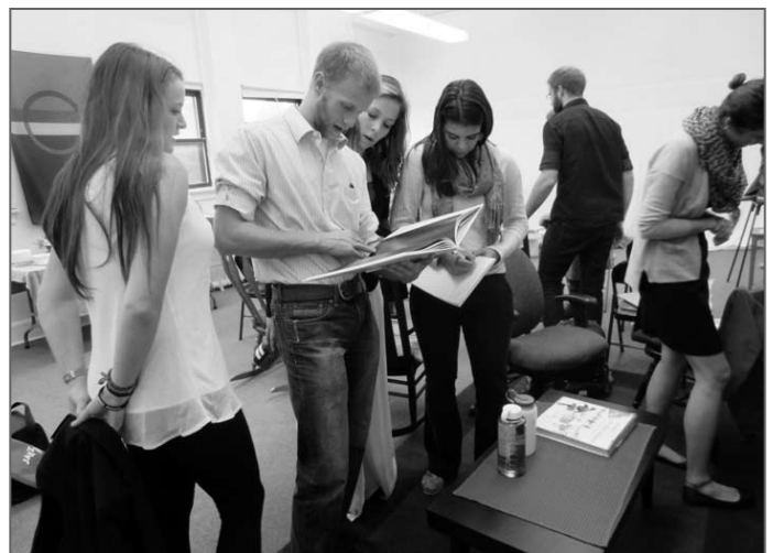
Extending the Link students look over research materials available at the Center.