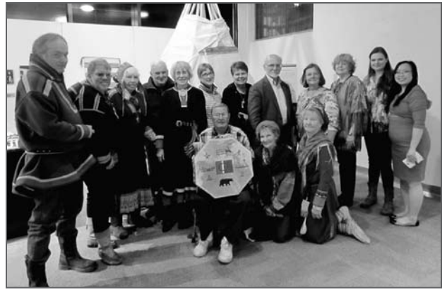
A group photo taken during the opening of the The Sami Reindeer People of Alaska exhibit.